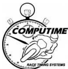
Clerk of Course - Peter Woods

COMPUTIME RACE TIMING SYSTEMS PTY LTD www.computime.com.au